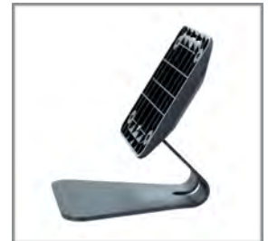
Adjustable Stand 30°/45°/60° Tilt AC-112