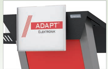
Logo holder for DIN A4 (horizontally/vertically )