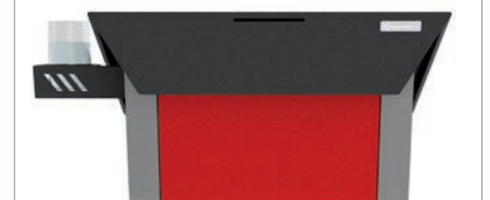
Front panel in stainless steel Front panel with foil Front panel powder-coated