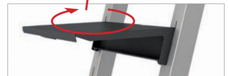
Projector tray or document deposit in one (approx. 40 x 25 cm)