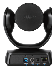
USB 3.1 type-B RS232 in/out LAN for IP streaming/ remote access DC 12V