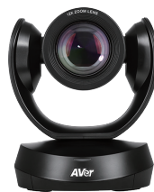
H182 x W142.7 x D153 mm