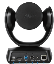
DIP switch HDMI out USB 3.1 type-B LAN for IP streaming and Power over Ethernet (PoE) DC 12V RS232 in/out